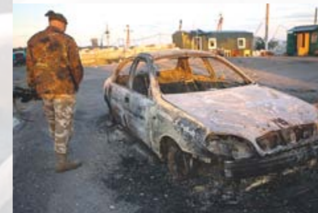
Customs control zone vicinity near Izvarine

There were incidents of the attacks of the armed groups of the supporters of “Russian spring” on the Ukrainian border units. The use of barrel artillery was not documented in May 2014.