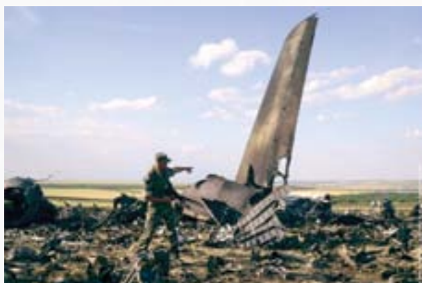
The remains of a downed IL-74

flight in 1988) was transporting the personnel for rotation, the vehicles and food. Two rockets at once, launched on 14 June 2016 from portable anti-aircraft missile systems (PAAMS) hit the Ukrainian plane during the landing in Luhansk airport, when Il-76 was around 700 meters high. In the position of IAF near Luhansk airport, from which Il-76 could have been hit, there were found three launch tubes 9P39-1 of PAAMS 9K38 “Igl’a”. Two PAAMS “Igl’a” were used, one — technically malfunctioned (the 9M39 missile remained in the tube).