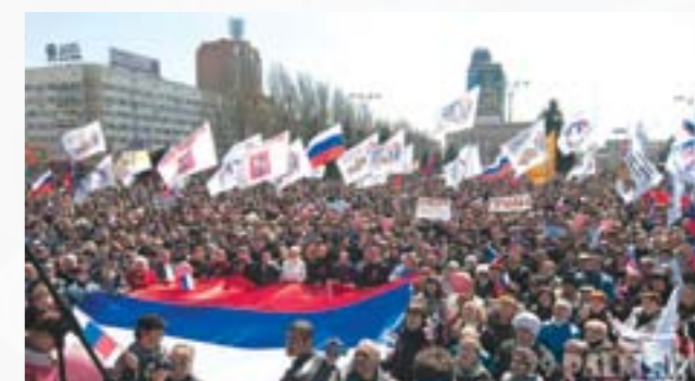
“Russian Spring” rally

In April 2014, the Ukrainian government stated that several areas in Donetsk and Luhansk regions were taken under control by the armed individuals whose work was coordinated by the Russian special services. The territories over which the Ukrainian government lost its control as of April 2014 included Donetsk, Mariupol, Kurakhovo, Avdiivka, Kostyantynivka, Bakhmut, Sloviansk, Kramatorsk, Lyman, Severodonetsk, Lysichansk, Pervomaysk, Alchevsk, Luhansk, Sverdlovsk, Rovenki, Krasniy Luch, as well as other populated areas within the perimeter of the map.