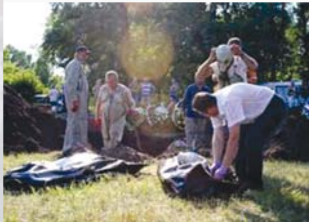
The mass grave of civilians who were killed by the armed formations of "DPR" in Sloviansk

In June 2014, after the Liturgy for the Trinity, pro-Russian separatists in Slavyansk abducted 4 Protestants. The reason for the abduction was that someone told the terrorists that the churchmen of the Church of the Transfiguration helped and nourish the soldiers of the Ukrainian Army and the National Guard, stood at the checkpoints around the Slavyansk and may report on the actions of the terrorists