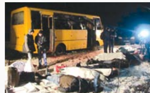
Shooting of the military near Volnovakha

al landscape park Velikoanadolskiy forest, was attacked by the members of IAF of the s.-c. “DPR”. They arrived in several cars, two of which were armored collectors’ cars of “Privatbank”. The Ukrainian military must have let them go through the block post, after that the Ukrainian forces were shot closely by small arms, anti-tank grenade launchers, machine guns and mortars. The wounded were killed by the snipers who were hiding in the forest belt on both sides of the road. After the end of the battle the reinforcements came — the Mi-8 helicopters.