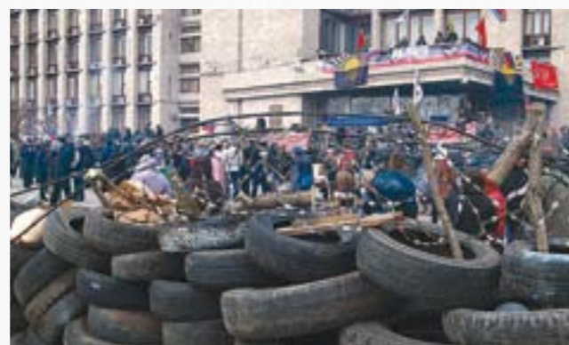
SSU building in Donetsk, occupied by the armed formations

The organized nature of crimes, their number and scale, coordinated actions in choosing the objects of attacks, the coordination of hostilities from a single control center, point to the systematic nature of those crimes.