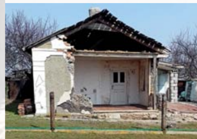
After the battles. Granitne

On 28 August, BTO “Vinnitsya” and “Khortitsya” in Novoazovsk retreated towards Mariupol after the shelling and the resulting sustained losses.