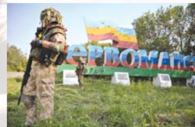
Outskirts of Pervomaik in Luhansk oblast

On 20–28 July 2014, UAF took under the control Olexandrivsk, Bile, Georgiivka, Lutuhine, Bilorichenskiy, Chelyuskinets, Vrubivskiy, partially Kirovsk and Pervomaysk.