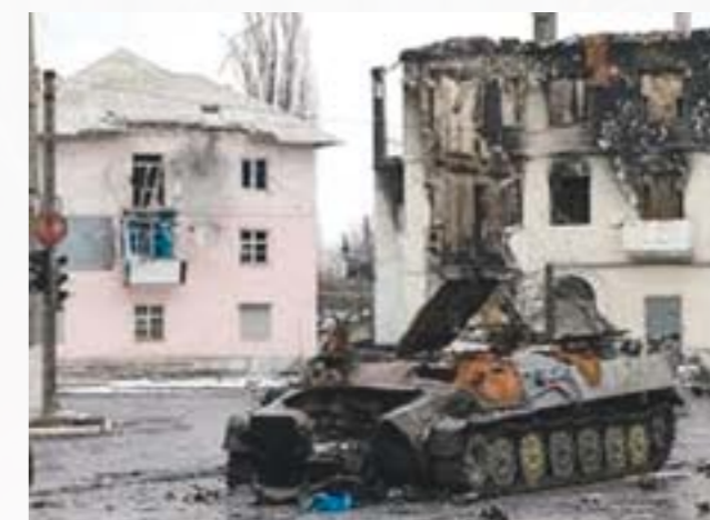
After the battles in Debaltseve

The assault continued to take place in the direction between Snizhne and Dmytrivka, to Latyshevo and further on to Rozsypne.