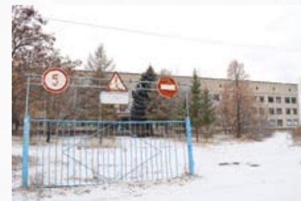
One of the places of dislocation of military in Stanytsia Luhanska

Head Office 120 , Pension Fund Office of Ukraine 121 in the Stanytsia Luhanska district of Luhansk Oblast, Department of State Registration of Civil Status Acts 122 of Stanytsia Luhanska district and Branch of the ‘Oshchadbank’ 123 of Ukraine. Also, in the ‘Report on human rights violations in the zone of an armed conflict in the Luhansk Oblast — Stanytsia Luhanska sector’ it is noted that the building of the school was destroyed due to the close placement of the artillery position of the UAF (Appendix 28, p. 29).