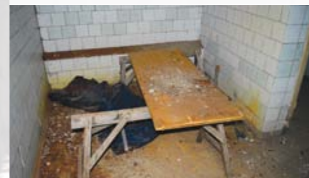
The basement room in the railroad hospital in Stanitsa Luhanska uts. where the prisoners were held

was a mention in the reports of HRMMU 254 . We have documented the cases of holding the prisoners in the places that were not suitable for detention at all.