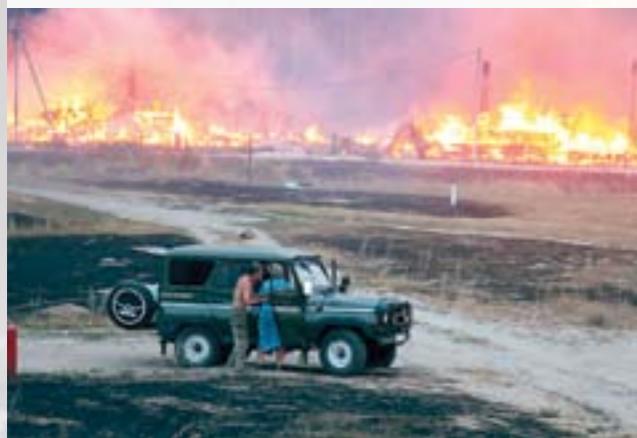
Ostrovskogo Street after the airstrike

The house next door burned, the barn burned. I asked a neighbour about his wife, and he replied: ‘she is killed’... 69