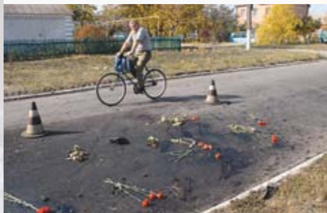
Sartana after the shelling

And I still feel guilty because I survived, but she died, and why six more died? Why?.. 77 .