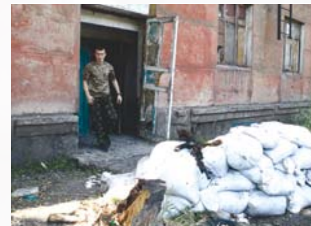
Zolote-4. UAF took a residential building

The members of armed forces occupied empty residential buildings and industrial objects. They were often building fortifications on the very territory of the populated areas. Several populated areas became divided by the line of contact — Zolote-4, Verkhnyotoretske, Kominternovo (Pikuzy), Maryinka, Pivdenne and Pivnichne (Toretsk), Zaytseve. In such areas, the hostilities were taken place directly in the residential blocks, thus endangering the life and health of local inhabitants.