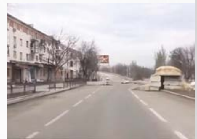
Block post within the borders of Donetsk city

military action in the event of fire 106 in the direction of the enemy, as reported by a P-02 person. (Appendix 22). Also, due to the close location of Avdiivka to Donetsk, armed groups of the so-called 'DPR' carry out shelling from residential neighborhoods located close, covering their military actions.