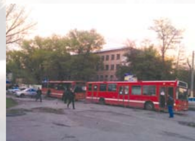
The building of Luhansk military registration office

As it became known, the person Sl. was kept in the so-called military commandant’s office in the premises of the regional military commissariat of Luhansk, at the address of the Krasnodonsk, 6 street. The interrogation was conducted in a room with sports equipment (“gym”) and because of the fact that the person Sl. was the member of the “Aydar”, he was tortured. On September 7, 2014, between 09.00 and 11.00 hours, during interrogation, unable to withstand torture, he died. According to the witness, at the same time, several representatives of the IAG “Rusich” brutally beat the person Sl. with hands and feet, resulting in his death. For half an hour the body was carried out in an unknown direction.