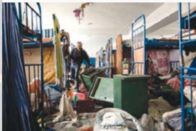
Chornukhine facility after the shelling

The institutions suffered the most from the shelling during the active hostilities in 2014–2015, but sometimes the correctional facilities are still being shelled 300 . IAF placed the military vehicles near PI with hundreds of defenseless detainees, they used the vehicles to shoot in the direction of Ukrainian military. Thus, they put the persons in the correctional facility in danger of the return fire, which often happened after some time. And when some of the convicts were injured or trapped under the rubble of a destroyed building, the members of IAF did not provide the urgent medical assistance.