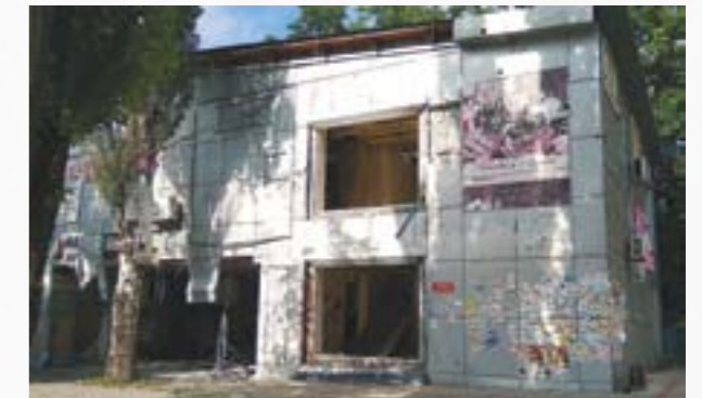
One of the rooms in Stanitsa Luhanska where the prisoners were held

Among them are: the railway hospital in Nova Kon-drashivka, the ‘Motobond’ shop, the service station at the entrance to the village, the storage premises in the center of the village, the storage premises of the ‘Ksenia’ store. 164