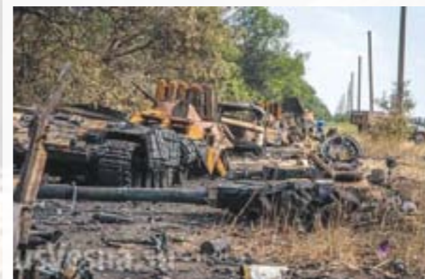
After the battles on 03.09.14 near Pobeda village

camp of the 27th rocket artillery regime was shelled by RSVF “Smerch” from the territory of the Russian Federation. 15 soldiers were killed as a result of the shelling, one soldier died in hospital of the burns, one more soldier disappeared.