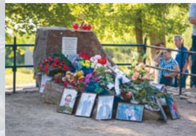
The monument for the people killed as a result of the airstrike on the children’s beach in Zuhres

The next day I went to work, a car with representatives of the IAG went to the city and all of them said that yesterday it were bombed from Ukrainian plane...’. 74