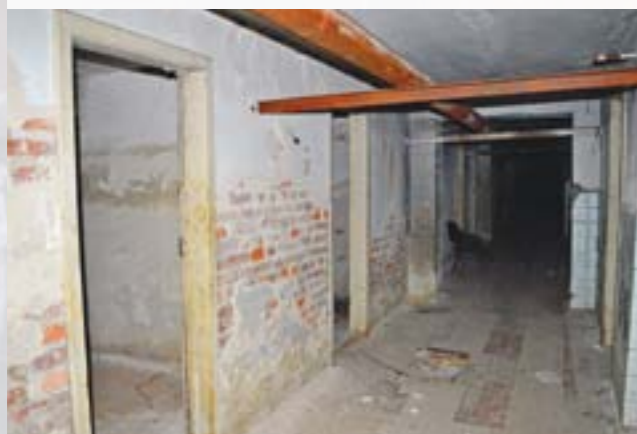
Illegal detention center in Stanytsia Luhanska uts.

Further, extrajudicial executions, in addition to a magnitude, have become systematic. A specific feature of these crimes is their commission in special places. The presence of special places for committing such crimes indicates their systematic nature.