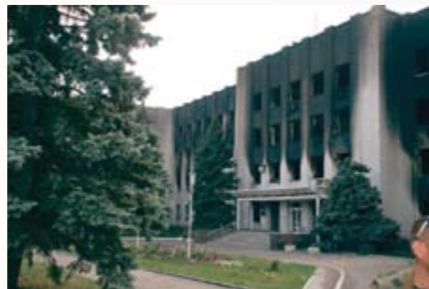
Burnt-down building OG the town council in Shakhtarsk

northern general direction, the second — on the next day to a direction unexpected for the enemy — towards Blahodatne.