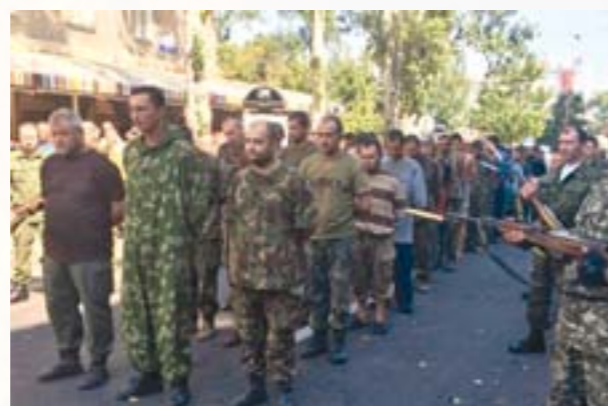
The march of shame in Donetsk

"marches of the prisoners" or walking through the "shame corridors". There are two documented cases of such, in our view, gross violations of human dignity of the persons who were forced to participate in them.